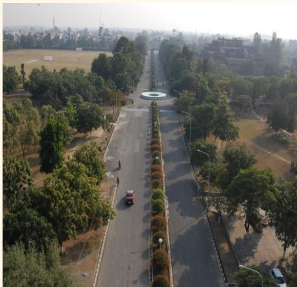
GNDU Amritsar: an aerial view of the green campus

Guru Nanak Dev University, a state university, was established on Nov. 24, 1969 to commemorate the 500 th birth anniversary of Shri Guru Nanak Dev Ji, the founder of Sikh religion. Guru Nanak Dev University is one of the premier universities of the country, which has been accredited with the 5 star (the highest level) accreditation thrice among the universities in India by National Assessment and Accreditation Council (NAAC) Bangalore. Guru Nanak Dev University has attained the highest status of University with Potential for Excellence (UPE) which is the highest status award by UGC. Apart from traditional areas of higher education, university has a reputation of promoting education and research in professional and technological fields, with the aim of creating human resources in the new but highly required areas in the country. In addition to academics, the University has the pride of winning the highest Inter-University professional and technological fields, with the aim of creating human resources in the new but highly required areas in the country.