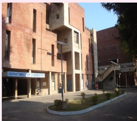
Department of Chemistry: UGC centre of advanced study.

and grading system is followed for teaching programmes. The research activities of the department focus on supramolecular chemistry, synthetic organic and inorganic chemistry, biological chemistry, chemistry of ionic liquids, electrochemistry, material chemistry, medicinal chemistry surfactant chemistry, oils and fats chemistry, thermodynamics, analytical chemistry etc. The research projects are funded significantly by agencies like CSIR, SERB, UGC, DST, DRDO, DAE and DBT.