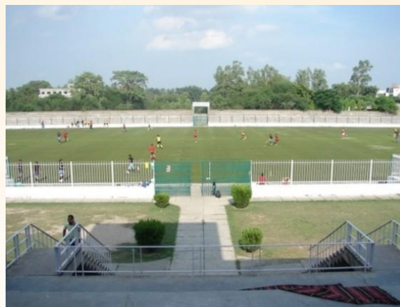
Stadium (Astroturf ground for hockey)

In addition to academics, the University has the pride of winning the highest Inter-University National Sports Award of the country “Maulana Abdul Kalam Azad Trophy”(MAKA) for a record number of 23 times.