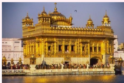
Golden Temple: an epitome of faith and serenity

it and build a big Sarovar (tank) on the site in AD 1564. Simultaneously, the foundation of a town was also laid. The construction of the tank and the town was completed in AD 1577. The town at first was called Chak Guru / Chak Guru Ram Das / Ram Das Pura, later on won its present appellation, Amrit from the holy tank which had been a source of exhilaration to the Sikh community.