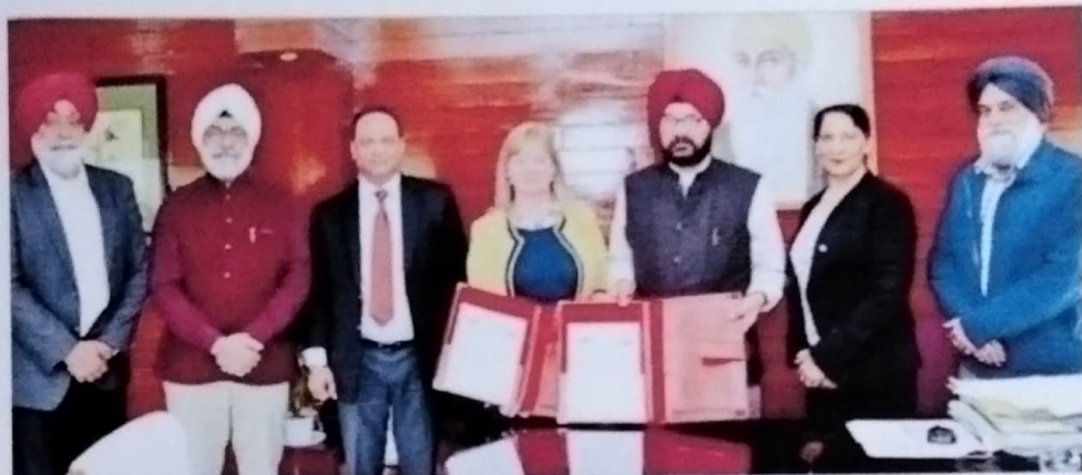
Officials of Guru Nanak Dev University and the Memorial University of Newfoundland, Canada, after signing a memorandum of understanding in Amritsar on Tuesday.